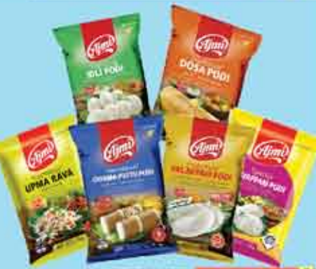
AJMI RICE POWDER ASSORTED 1 KG/PC 0.430