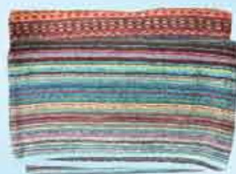
SOFT COMFORT BATH TOWEL 75 X 150 ITL004 1.000