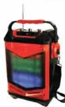
SANFORD RECH PORTABLE SPEAKER 20W SF2260RPS 13.990