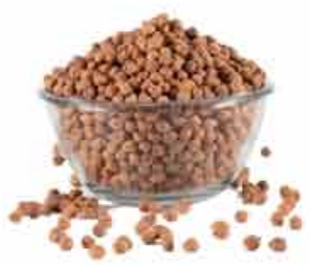
BLACK CHANA WHOLE/KG 0.345