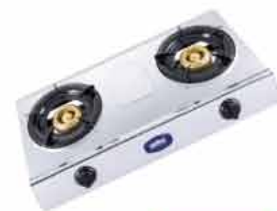
SANFORD STAINLESS STEEL GAS STOVE 2 BURNER SF5356GC 2B 7.500