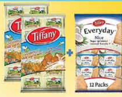
TIFFANY GLUCOSE BISCUITS ASSORTED 36X50 GM 0.890