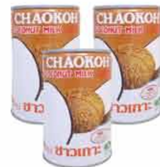
CHAOKOH COCONUT MILK 3X400 ML 1.190