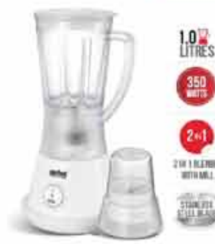
SANFORD 2 IN1 BLENDER 350 WATTS 1.0 LITRE SF6842BR 5.990