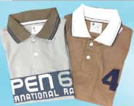
ACTIVE MENS T-SHIRT POLO P252 1.500