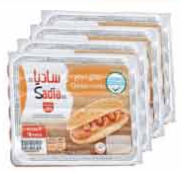
SADIA CHICKEN FRANKS 4X340 GM 0.990