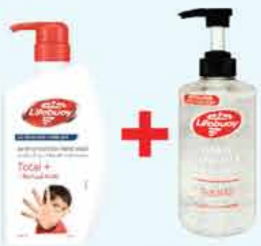
LIFEBUOY HAND WASH 500ML + LIFEBUOY SANITIZER 500 ML 1.690