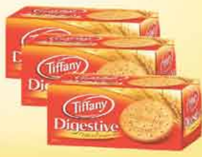
TIFFANY DIGESTIVE BISCUITS 3X250 GM 0.775