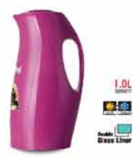
SANFORD VACCUM FLASK 1.0LTR SF10527VF 2.990