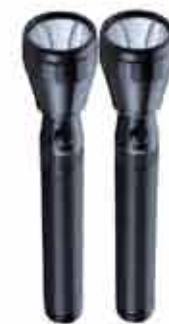
SANFORD (25C*2PCS) SEARCHLIGHT COMBO SF5810SLC 6.990