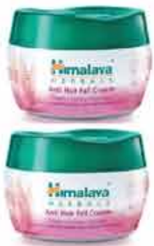
HIMALAYA HAIR CREAM - 2X140ML 0.845