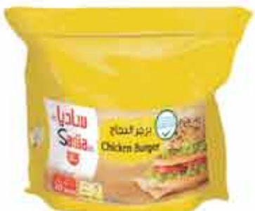
SADIA CHICKEN BURGER 1 KG 1.190