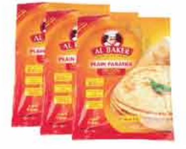
AL BAKER PARATHA 3X400 GM 0.890