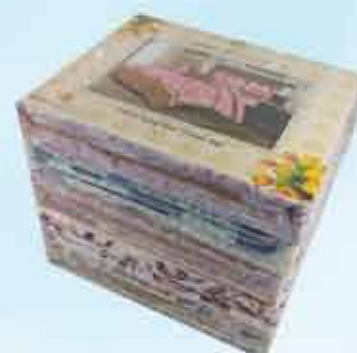
GOLDEN TULIP BED SHEET DBL 230X254CM 3.400