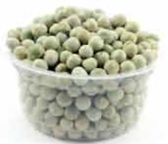
GREEN PEAS/KG 0.300