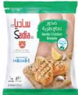
SADIA TENDER CHICKEN HALF BREAST 1 KG 1.000