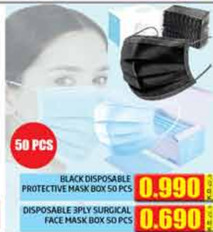
50 PCS BLACK DISPOSABLE PROTECTIVE MASK BOX 50 PCS 0.990 DISPOSABLE 3PLY SURGICAL FACE MASK BOX 50 PCS 0.690