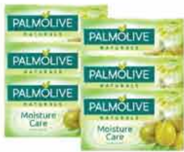
PALMOLIVE SOAP ASSTD 120GM 5+1 FREE 0.690