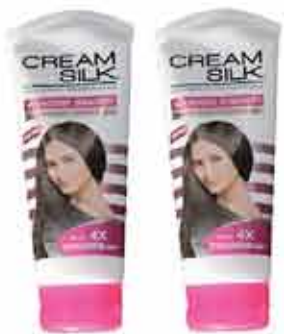
CREAM SILK HC STANDOUT 2*180ML 1.190