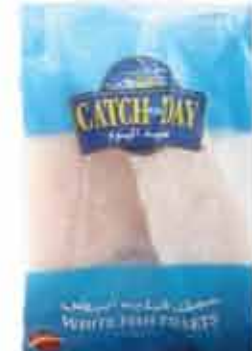
CATCH OF THE DAY FROZEN FISH FILLETS 1 KG 0.790