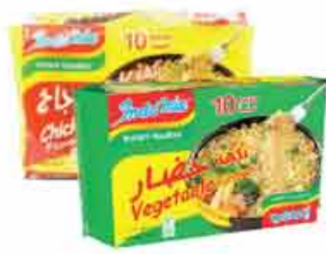
INDOMIE NOODLES ASSORTED 10X75 GM 0.730