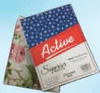
ACTIVE FLAT BED SHEET SINGLE P235 1.250