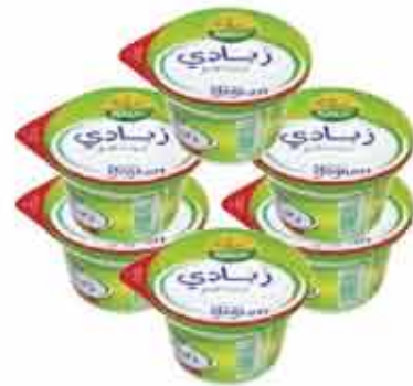
NADA FRESH YOGHURT FF/LF 6X170 GM 0.360