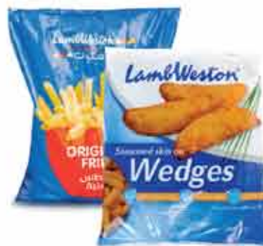
LAMB WESTON REGULAR FRIES / WEDGES 2.5 KG/PC 1.000