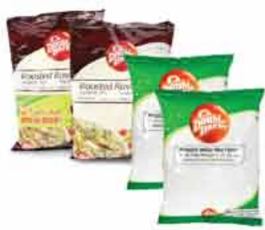
DOUBLE HORSE ROASTED RAVA / RICE POWDER ASSORTED 2X1 KG 0.950