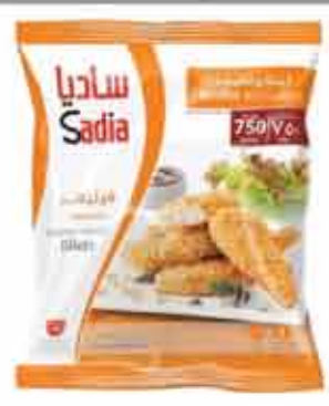
SADIA BREADED CHICKEN FILLET POLYBAG 750 GM 1.050