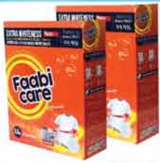
FAABI CARE DETERGENT POWDER 2X2.5 KG 1.795