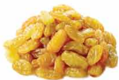
GOLDEN RAISINS /KG 0.745