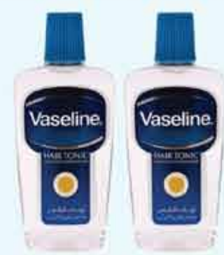
VASELINE HAIR TONIC 2 X 400 ML 1.790