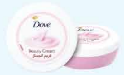
DOVE BEAUTY CREAM 2X150GM 1.090