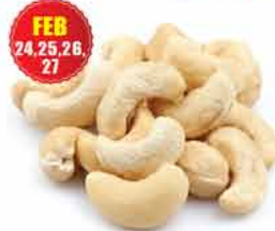
CASHEW NUT/KG 2.990