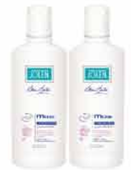
JOLEN MOISTURIZER LOTION ASSTD 500ML 1+1 FREE 1.090