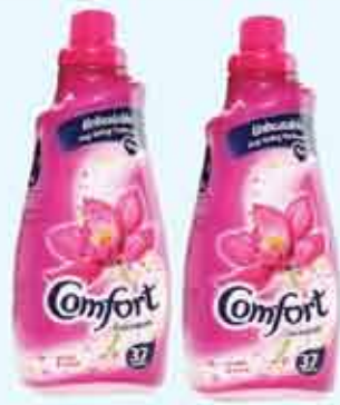
COMFORT CONCENTRATE 2 X 1.5 LTR ASSTD 1.990