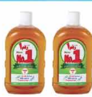
NO.1 ANTISEPTIC DISINFECTANT LIQUID 2X500ML 0.890