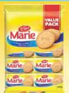
TIFFANY MARIE BISCUIT 12 X 100 GM 0.895