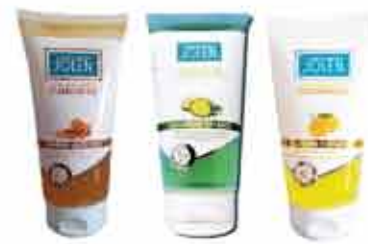
JOLEN FACEWASH ASSTD 150ML 2+1 FREE 1.090