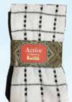
ACTIVE KITCHEN TOWEL PACK OF 6 P263 1.000