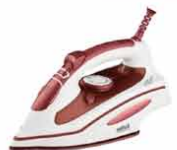
SANFORD STEAM IRON SF70SI 5.490