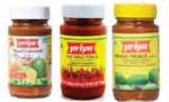
PRIYA PICKLE - ASSORTED 3X300 GM 0.990