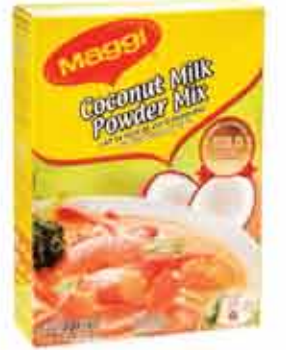
MAGGI COCONUT MILK POWDER 300 GM 0.625