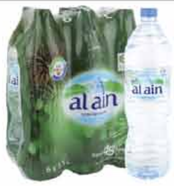
AL AIN WATER 6X1.5 LTR 0.295