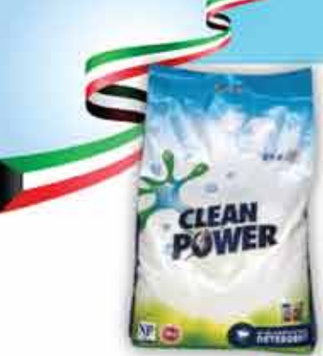
CLEAN POWER DETERGENT POWDER 6KG 1.890