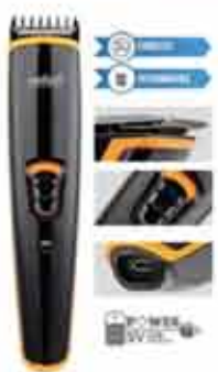
SANFORD RECHARGEABLE CORDLESS HAIR CLIPPER 3 WATTS SF196BHC 1.990