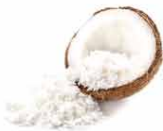
COCONUT POWDER/KG 0.990