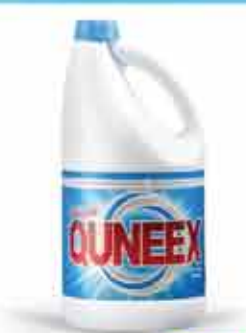
QUNEEX BLEACHING LIQUID 3.78LTR 0.490