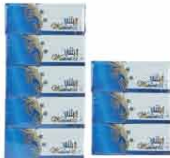
WATANI TISSUE 8 X150 5 2 PLY 0.990