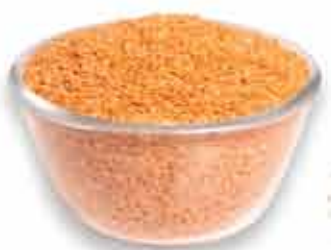
MASOOR DAL /KG 0.290