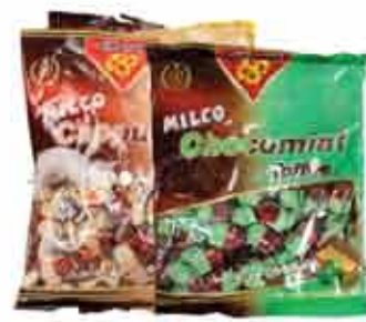
AL SEEDAWI TOFFEE MILCO CHOCO + CAPPACIUON + CHOCOMINT 400 GM 2+1 FREE 1.090