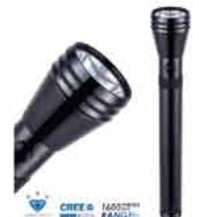
SANFORD RECH LED SEARCH LIGHT 35C BATTERY SF4669SL BS 2.990