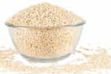
URAD DAL /KG 0.545