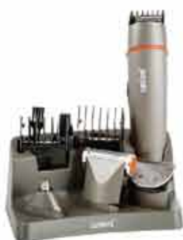
SANFORD 6 IN 1 RECHAR HAIR CLIPPER WITH NOSE /EAR TRIMMER SF9711HC 6.990