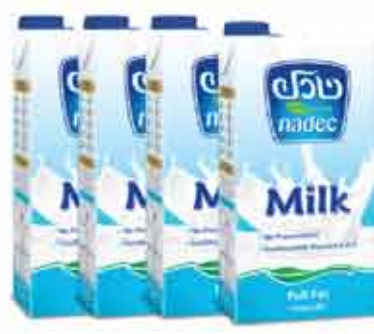
NADEC LONG LIFE MILK FF 4X1 LTR 0.890