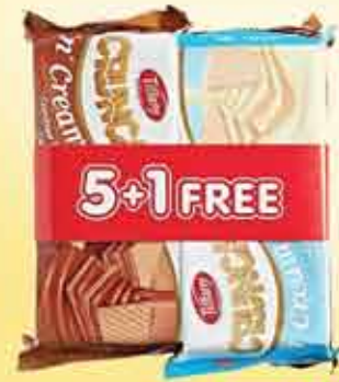
TIFFANY CRUNCH N CREAM WAFERS 76 GM 5+1 FREE 0.650