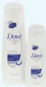
DOVE SHAMPOO ASSTD 400ML+180ML 1.190