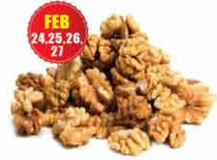
WALNUT /KG 3.250