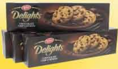
TIFFANY DELIGHT CHOCOLATE CHIP COOKIES 4X100 GM 0.895