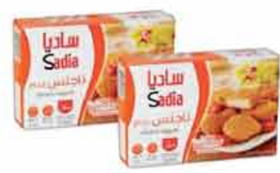
SADIA CHICKEN TRADITIONAL NUGGETS 2X270 GM / CRISPY NUGGETS 2X270 GM 0.590