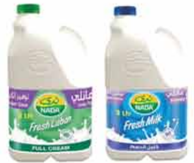
NADA FRESH FULL CREAM MILK /LABAN 3LTR /PC 0.895