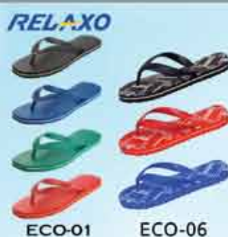
RELAXO HAWAII SLIPPER ECO-01/SLIPPER ECO-06 0.700