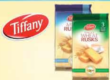
TIFFANY RUSK MILK/WHEAT 2X335 GM 0.690