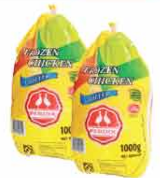
PERDIX WHOLE CHICKEN 2X1000 GM 1.190