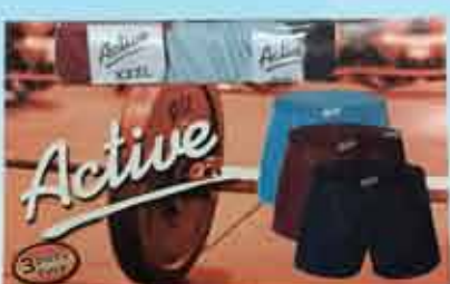
ACTIVE MENS SEMI-LONG DRAWERS PACK OF 3 -P263 1.000