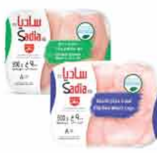
SADIA CHICKEN BREAST B/I S/O / WHOLE LEGS 900 GM 0.695