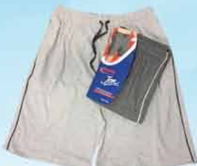
RUPA JON BERMUDA COLOR RP100 1.200