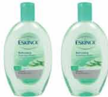
ESKINOL CLEANSER ASSTD 2X225ML 0.850